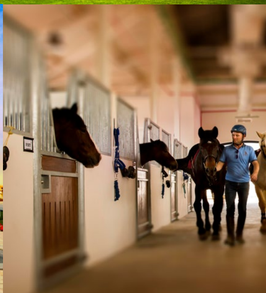
An equestrian haven with 520 stables offering lessons in horseback riding, polo, show jumping and dressage