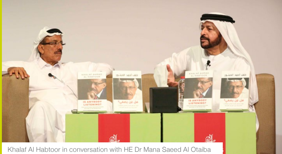
Khalaf Al Habtoor in conversation with HE Dr Mana Saeed Al Otaiba