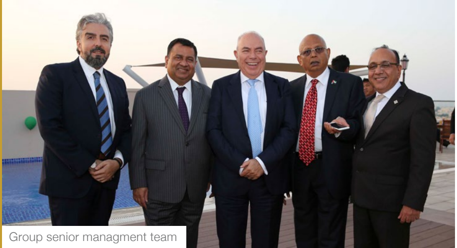
Group senior management team