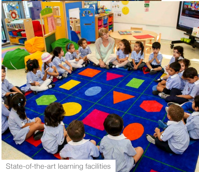
State-of-the-art learning facilities