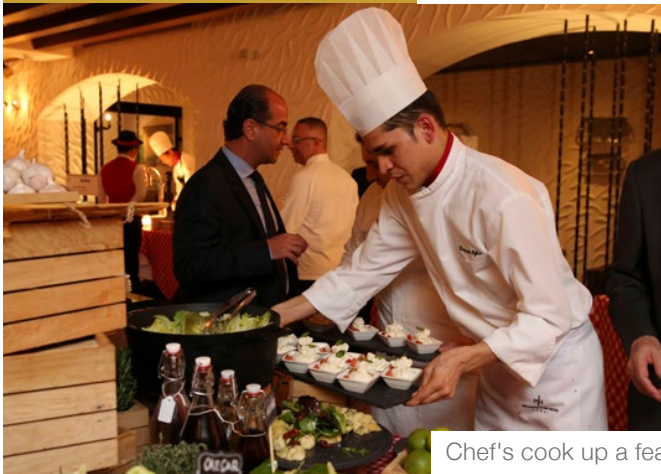
Chef's cook up a feast at Don Corleone