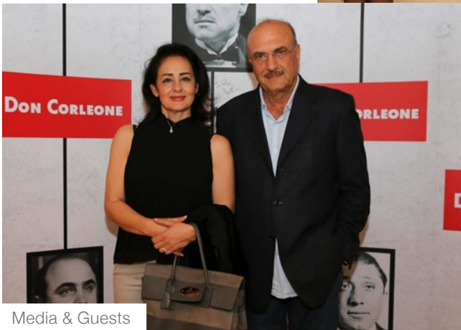
Media & Guests