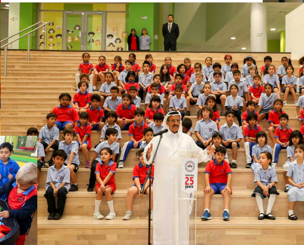
The opening coincides with the school's 25th anniversary celebrations