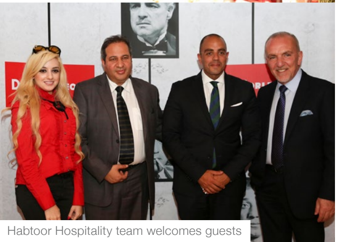
Habtoor Hospitality team welcomes guests