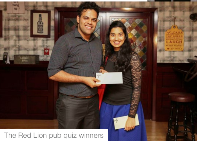
The Red Lion pub quiz winners