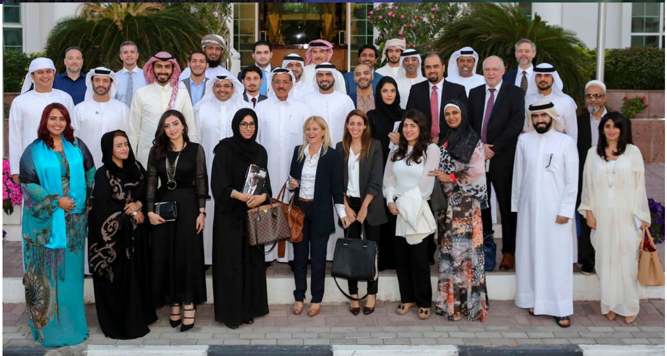
Audience of the second Open Talk held on 22 February 2017