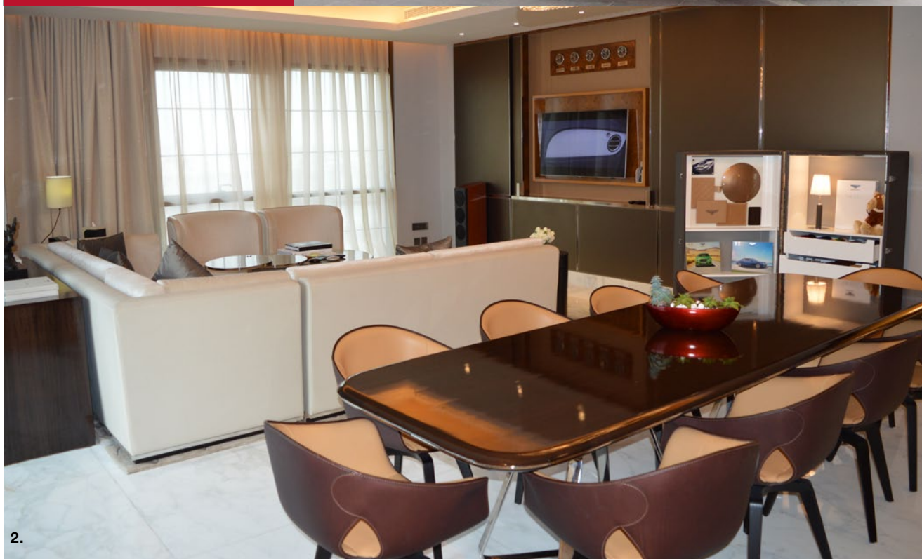
1.The new 17MY Mulsanne parks in front of The St. Regis Dubai, Al Habtoor City 2. Inside the Bentley Suite