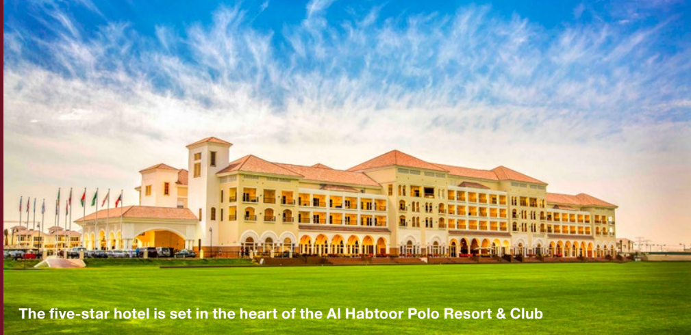
The five-star hotel is set in the heart of the Al Habtoor Polo Resort & Club