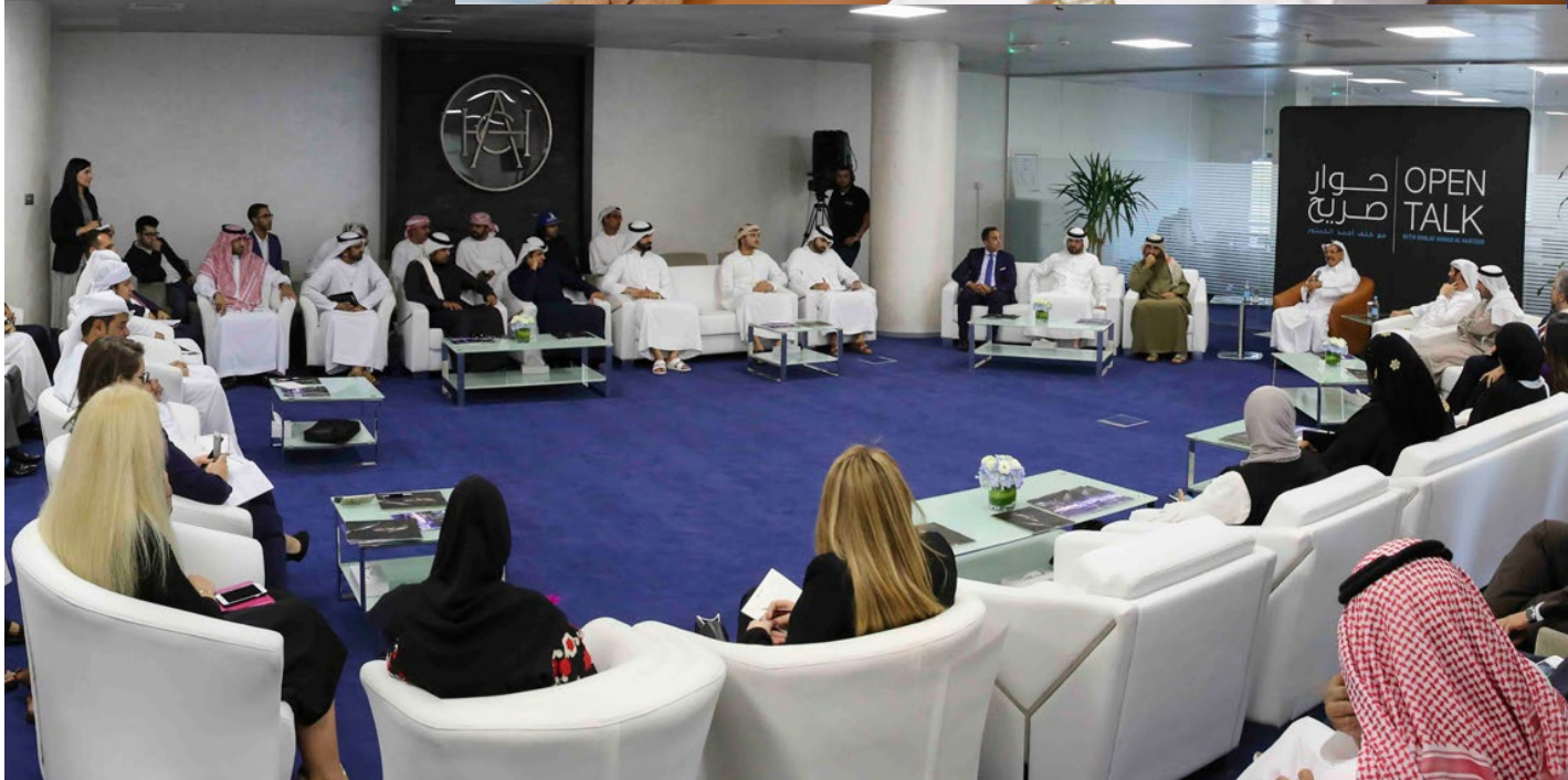
Audience of the inaugural Open Talk held on 17 January 2017