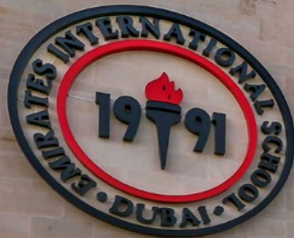
Emirates International School – Jumeirah Early Years programme new building