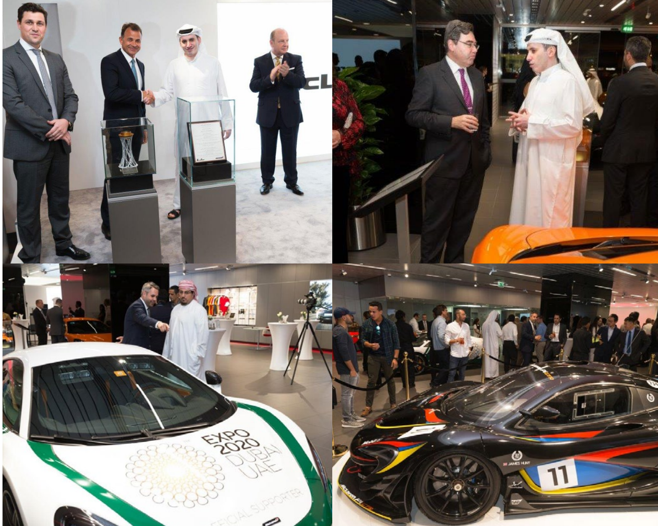
Al Habtoor Motors invests AED 4.4 million to build the new 647 sq m showroom