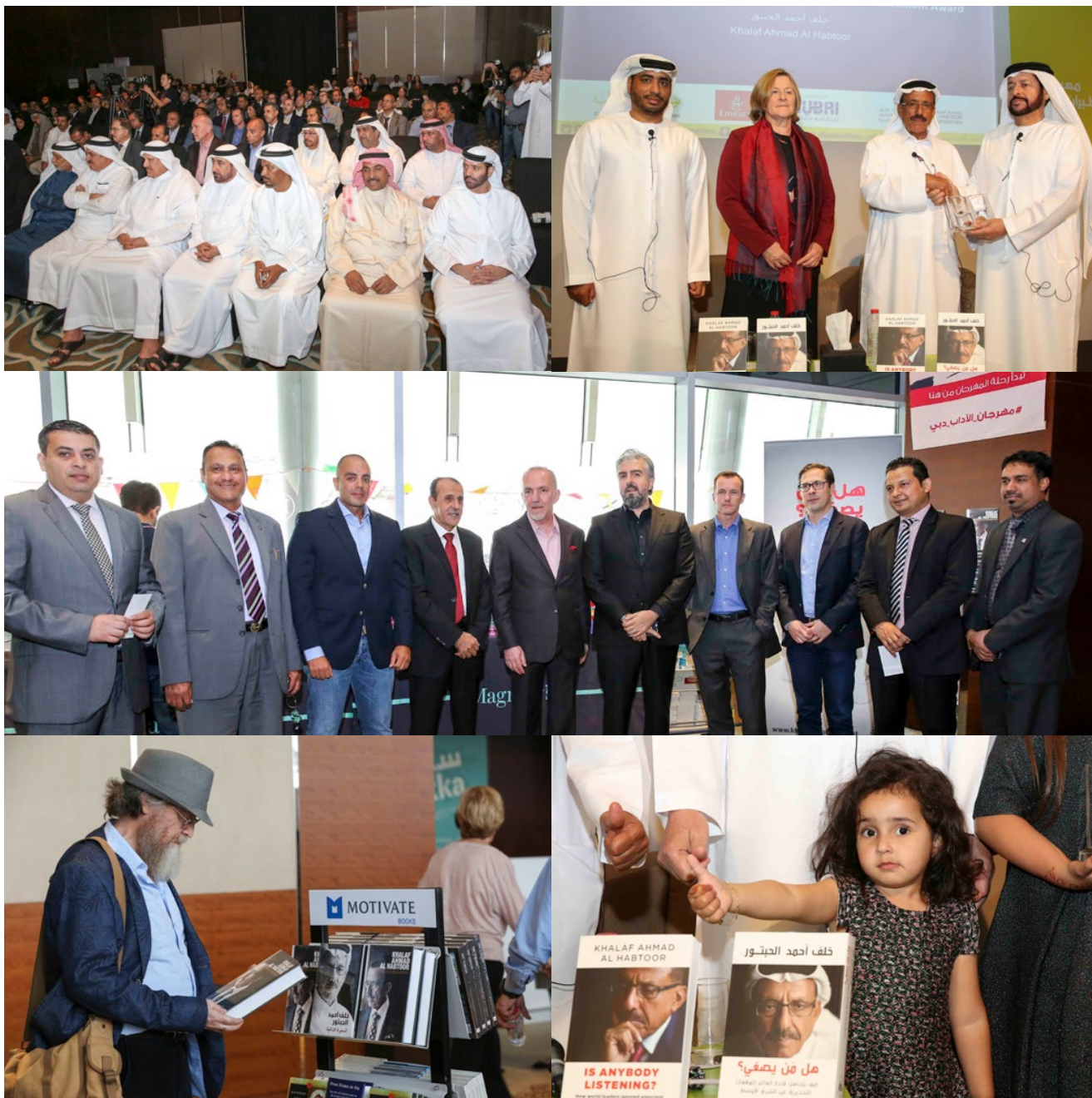
The session brought together an audience from across the UAE and abroad

prolific poet, writing 42 books of poetry, in colloquial Arabic, formal Arabic, and English, along with novels and non-fiction books about the Petroleum Industry. The story of his novel Karima was later adapted for television as well. His stature in the literary world has seen him receive many accolades, including honorary doctorates from universities around the globe.