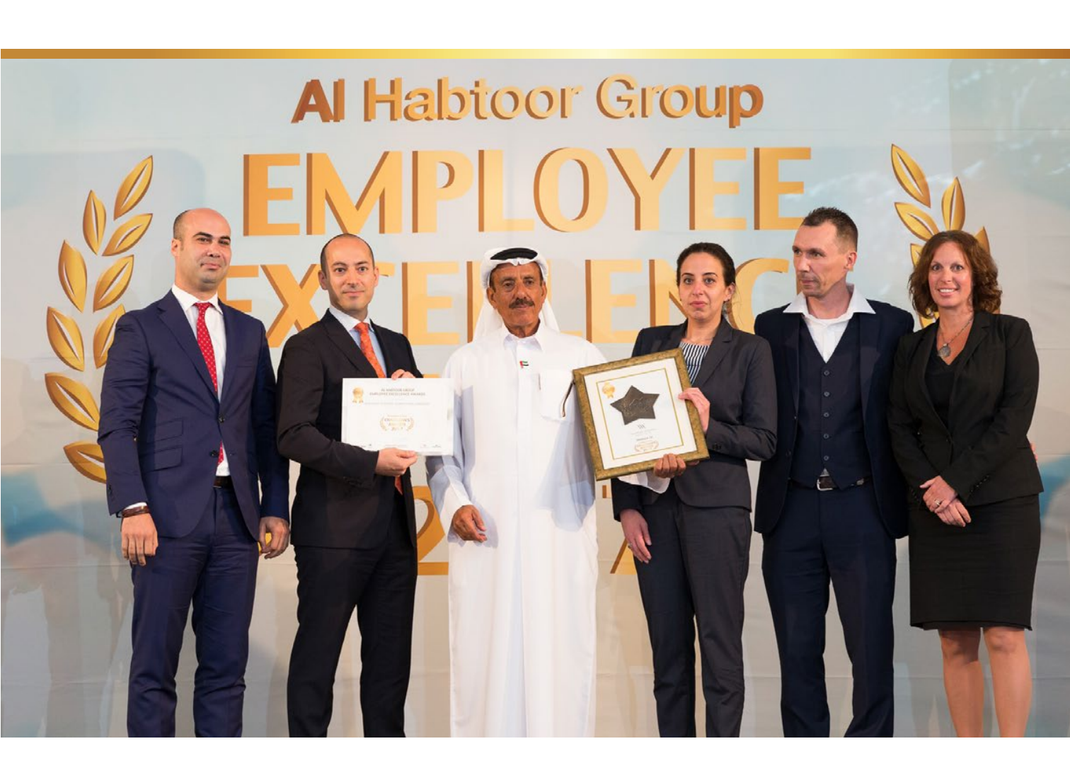
Waldorf Astoria Dubai, Palm Jumeirah HH