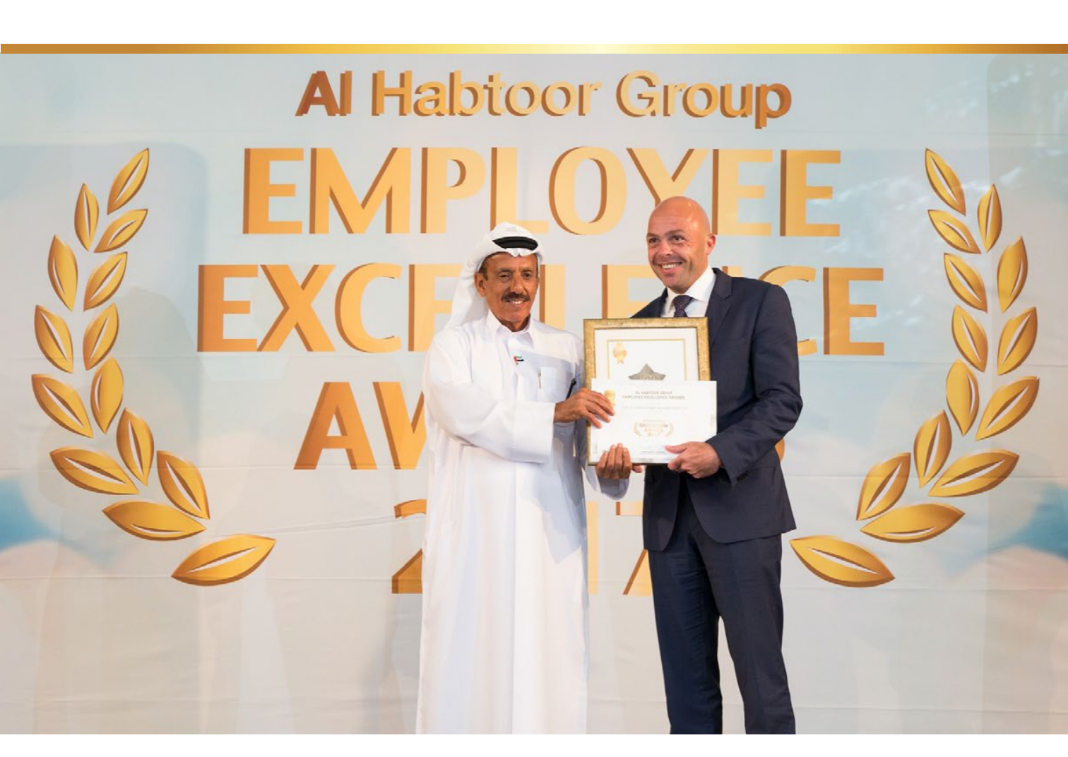
The St. Regis Dubai HH