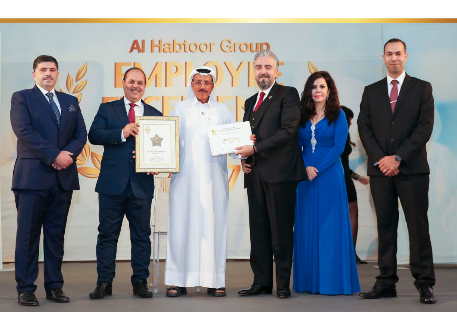
Legal Department AHG