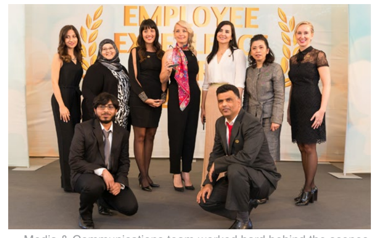
Media & Communications team worked hard behind the scenes

Guests take pictures for the Group's social media #EmployeeExcellenceAwards #AlHabtoorGroup #Habtoorians