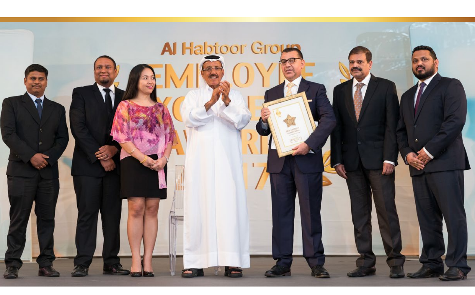
Procurement Department AHG