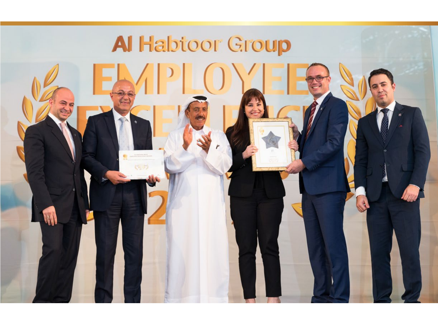
Habtoor Grand Resort, Autograph Collection _{\mbox{\scriptsize HH}}