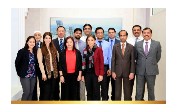
Finance Department AHG