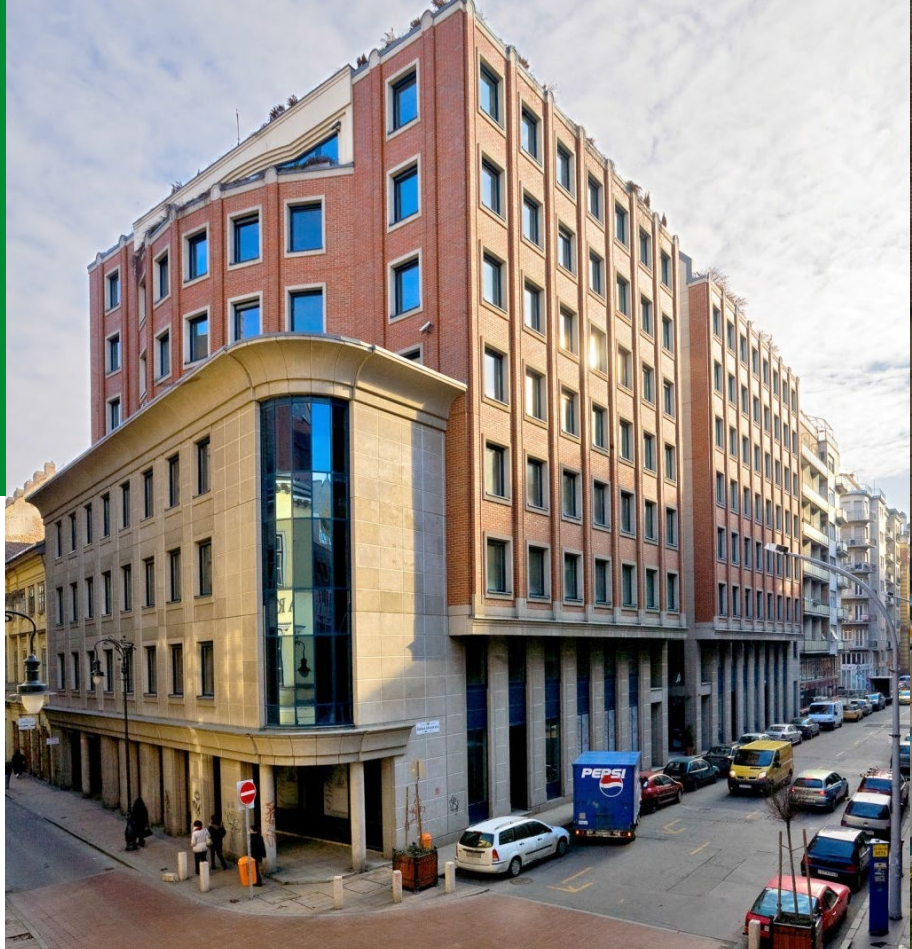
Rumbach Center, an office building located in the historic part of Budapest's financial, commercial and administrative centre