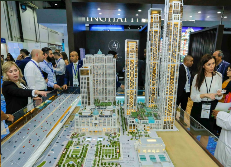
Thousands of visitors passed by the Al Habtoor Group stand from 6-8 September 2016