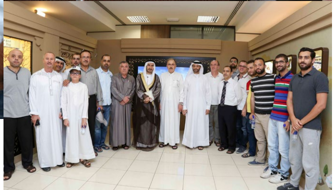
Hajj is one of the five pillars of Islam. Hundreds of guests visited the interactive educational exhibit from 26 August to 2 September 2016