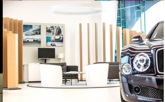
1. Bentley's flagship showroom offers an extraordinary blend of contemporary and luxury customer experiences 2. The exterior façade is decorated with 160,000 LED lightbulbs