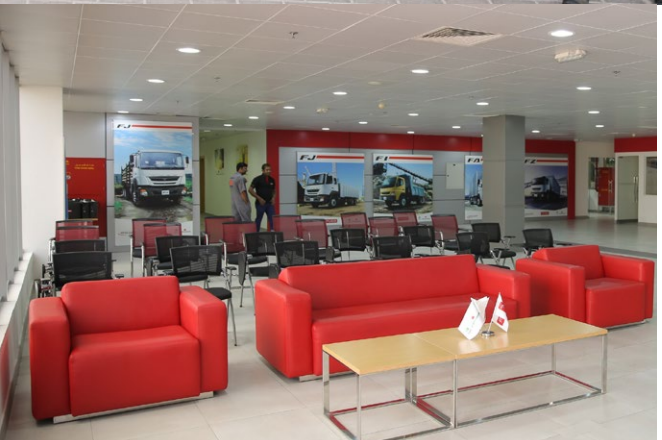
The FUSO Fabricators Event was held under the theme 'Building Bridges'