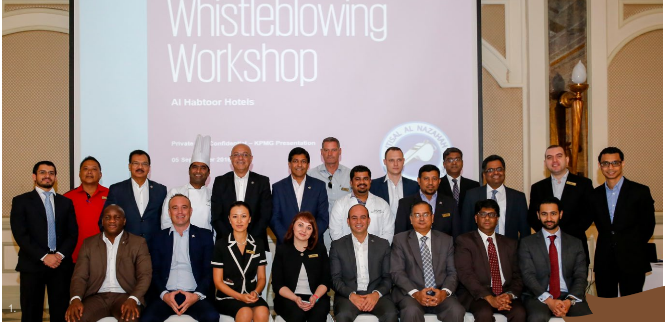
1. The seminar was hosted at the AI Andalus Ballroom on Monday 5 September 2016 2. Group's Internal Audit team