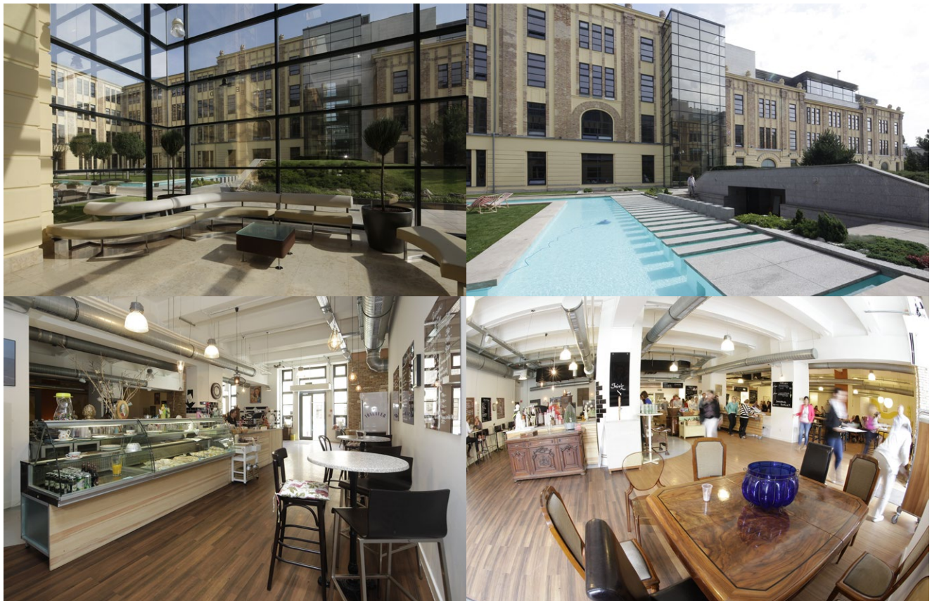
Dorottya Udvar, a high quality prestigious office complex located in Újbuda