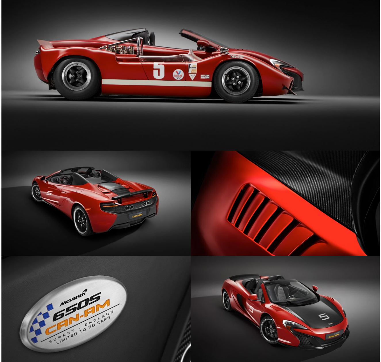
One of 50 limited edition McLaren 650S Can-Am made its UAE debut in August 2016. McLaren Can-Am is built of the latest technologies and materials such as carbon fibre.