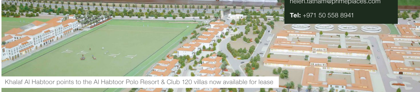
Khalaf Al Habtoor points to the Al Habtoor Polo Resort & Club 120 villas now available for lease