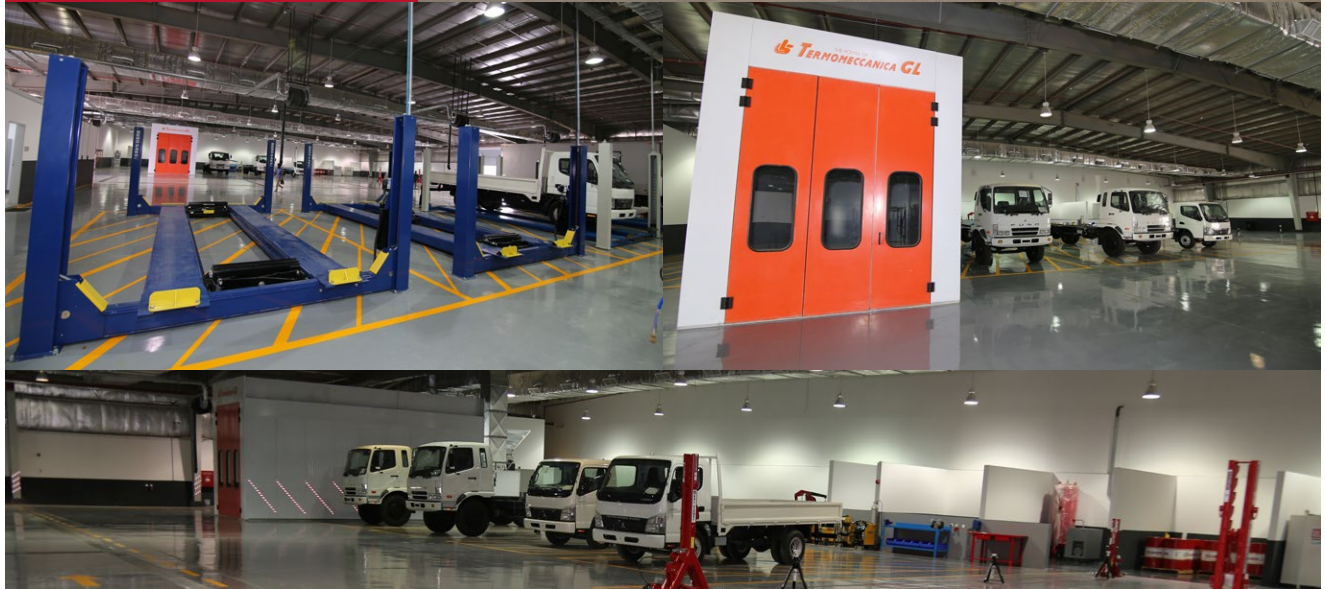
The Group's automotive division expands to new customers in Saudi Arabia. A look inside the new FUSO facility.