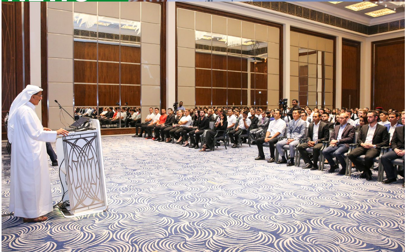
Staff gathered at the Al Joud Ballroom, Westin Dubai, Al Habtoor City