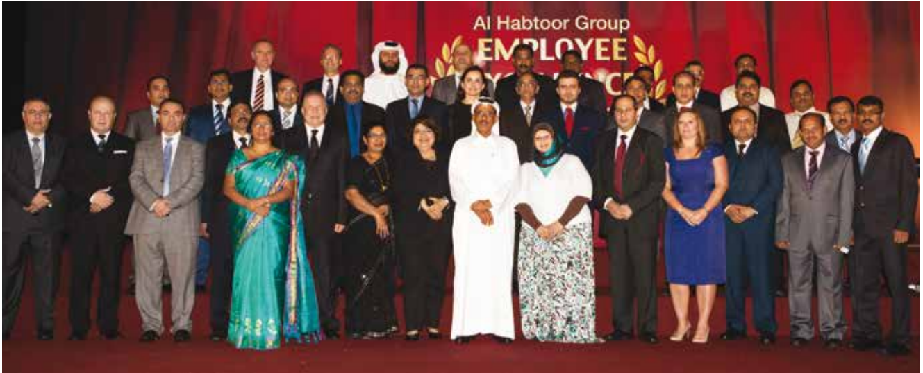
The winning team!