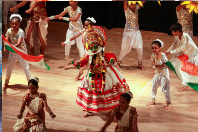
Celebrating diversity at EIS-Jumeirah with students from 80 different countries from across the world!