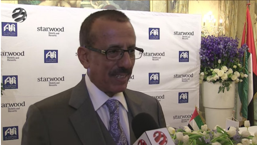
Click on the above to watch Khalaf Al Habtoor's interview for Globo TV

Selected ingredients of highest quality give the Imperial Torte its distinctive aroma - cacao cream is layered between delicate wafers of almond pastry and then covered in fine marzipan and a rich glaze of chocolate. A mouthwatering and must-try treat!