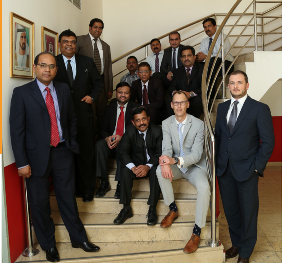
The team at Diamondlease in charge of the project.