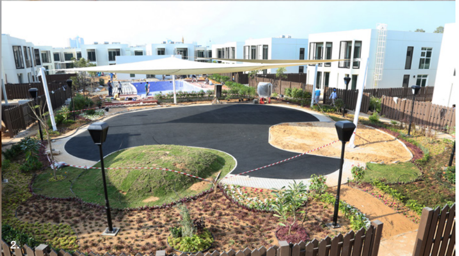
1. Dubai's newest residential community is located in the heart of the city! 2. Great landscaping, a children's playground and community swimming pool