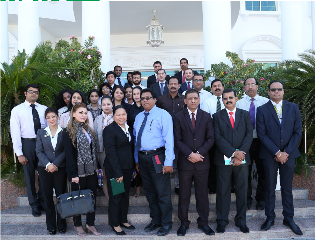
2016 annual medical seminar was attended by nearly 30 staff from across the Group

The Risk Management Department hosted a productive session to discuss the new developments made to the AHG junior staff medical scheme on February 9, 2016 at head office theatre.