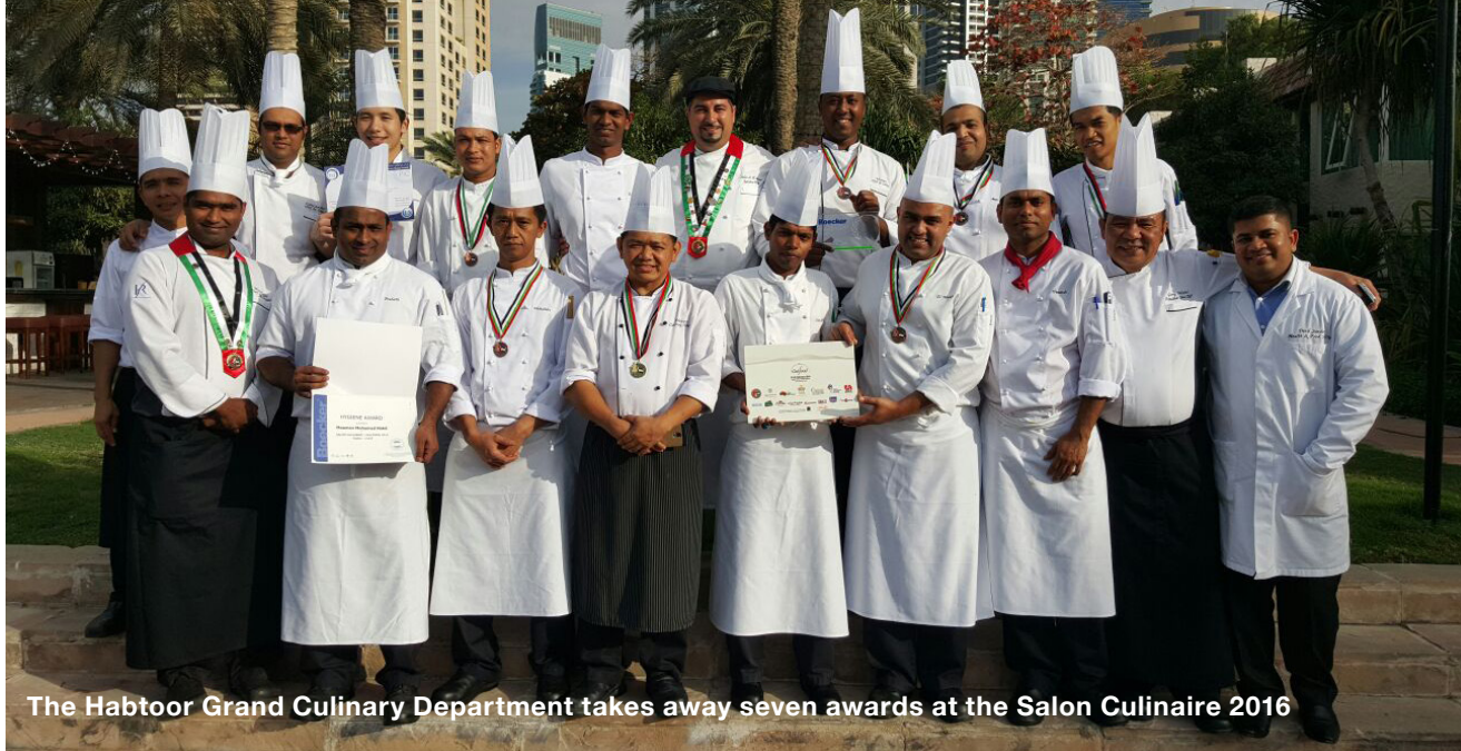
The Habtoor Grand Culinary Department takes away seven awards at the Salon Culinaire 2016