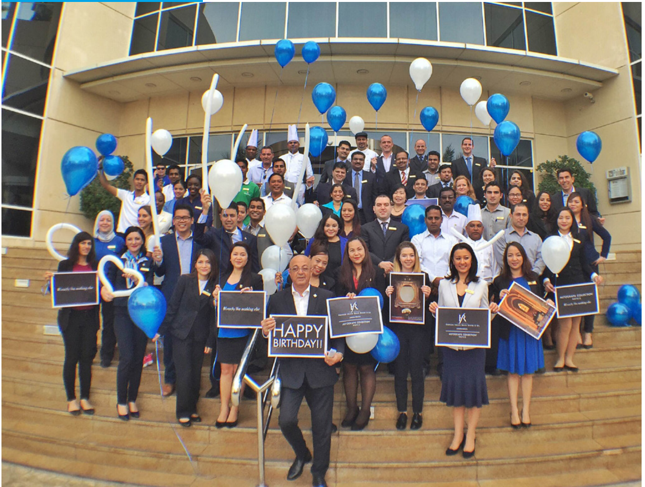
The team celebrates with balloons and cake!

The Habtoor Grand Beach Resort & Spa, Autograph Collection celebrated its 1st anniversary as an Autograph Collection Hotel on February 15, 2016.